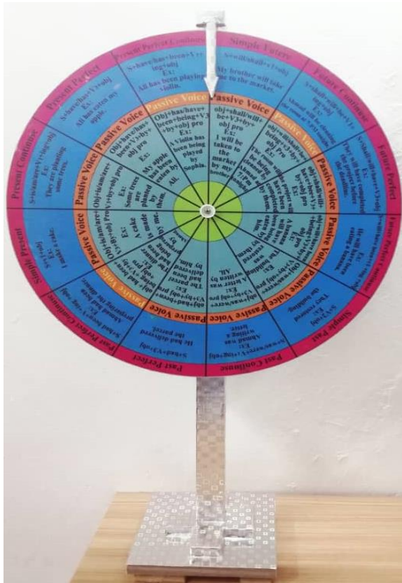
Figure: Tense and Voice Wheel