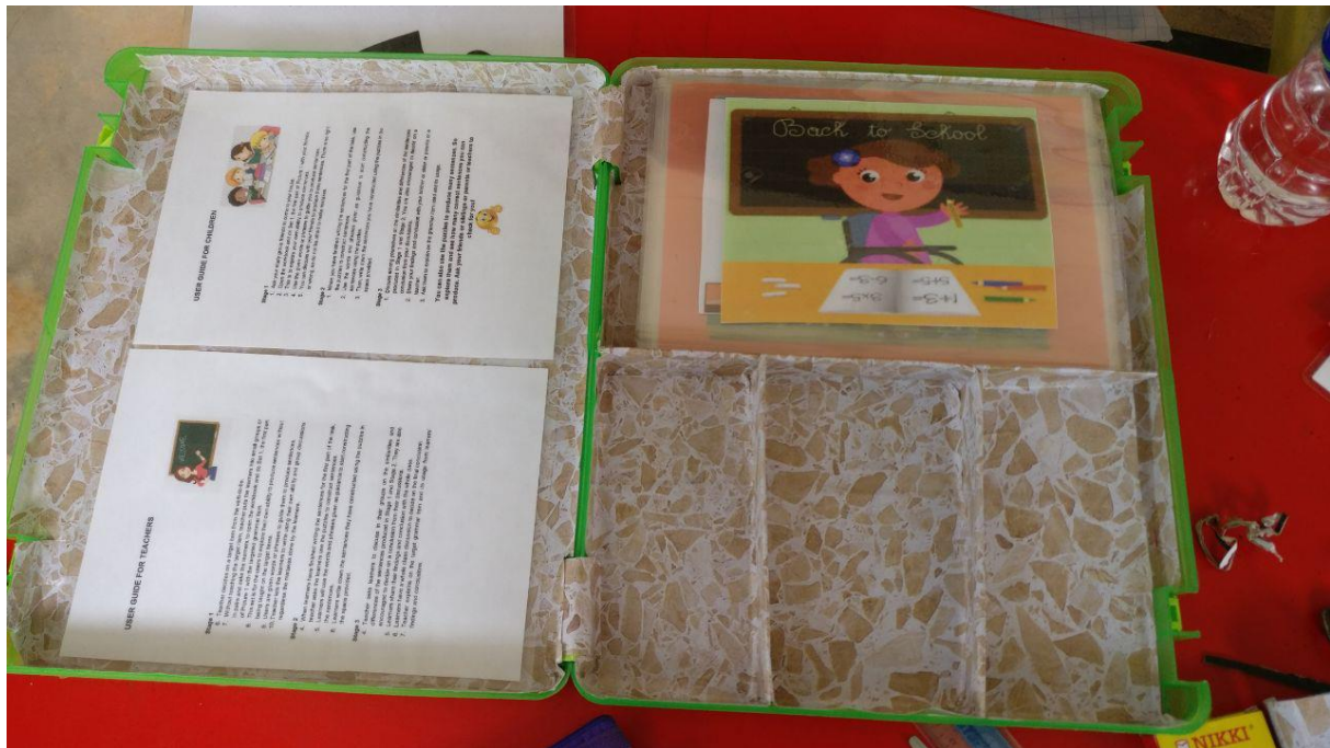
Figure 5. PuzSVA kit