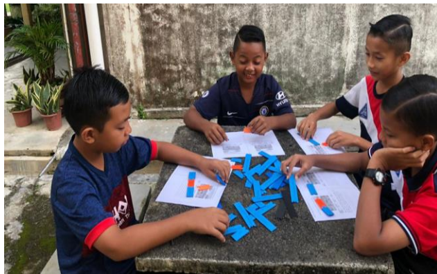
Figure 6. Self-learning in groups