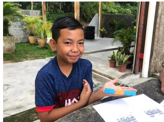
Figure 7. A learner producing a correct sentence using "is"