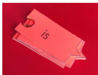
Figure 1. Verb-to-be “is”

Each set will be accompanied with a workbook of tasks to help learners to learn better. These sets of puzzle are developed to help learners who keep making subject-verb-agreement mistakes which are missing the verb-to-be in a sentence produced and also using incorrect verb form to complement the subject in a sentence produced.