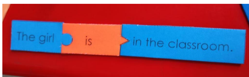
Figure 2. Sample of correct sentence