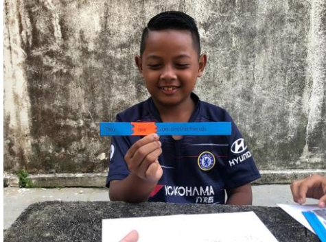
Figure 8. A learner producing a sentence using “are”